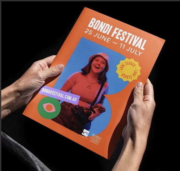
Face of Bondi festival 2021

Upcoming project for Lulu include the airings of TV shows 'Born to Spy' and 'Barons' and the airing of new podcast/musical 'twinemies', where she voiced and recorded an original soundtrack for the main character 'Darcy'.