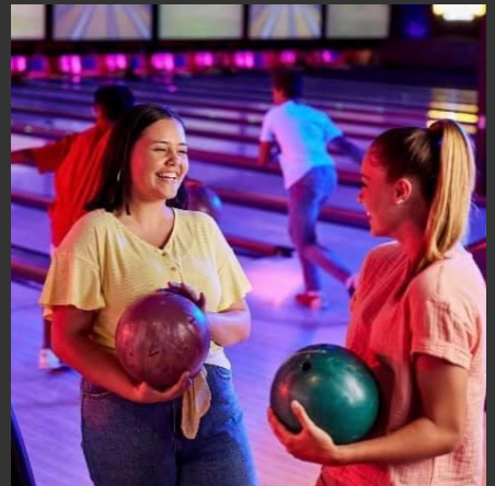
Zone bowling stills