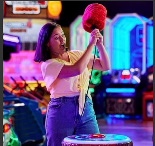
Timezone arcade stills