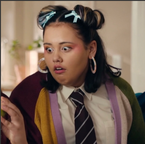
Dutch in Parent up

Shortly after, Lulu was booked in a supporting role in ABCme's new series 'Born to spy', as the main characters best friend 'Dutch'. The quirky, nerdy girl who is Kpop and robotics obsessed. Born to spy is set to premiere late 2021.