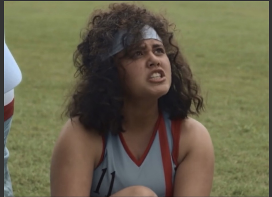
Amanda in Frayed season 2