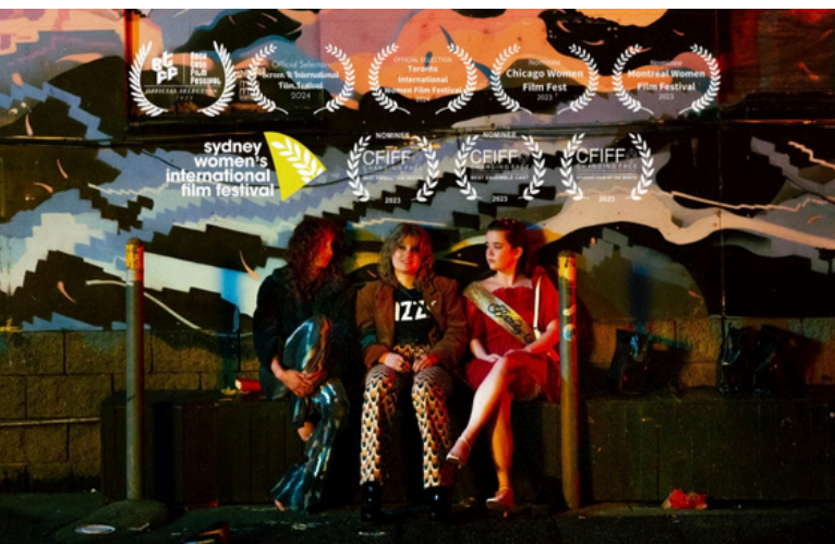
'The Adult Store' Short Film - Lead Role 2023 Winning Engaging Lead Performance at SIFFF