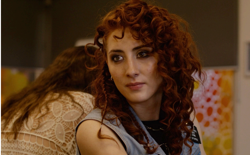
'Stream' Feature Film 2024 Lead Role. Premiering in September