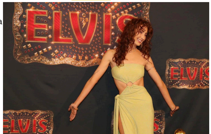
'Elvis' Premiere 2022