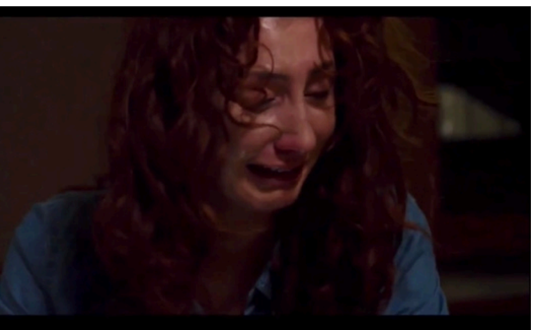
'The Haunting at Saint Joseph's/ The Hanged Girl (US Title) 2023 Amazon, Apple TV, Google Play Supporting role Winning Best Supporting Actress at IndieFest