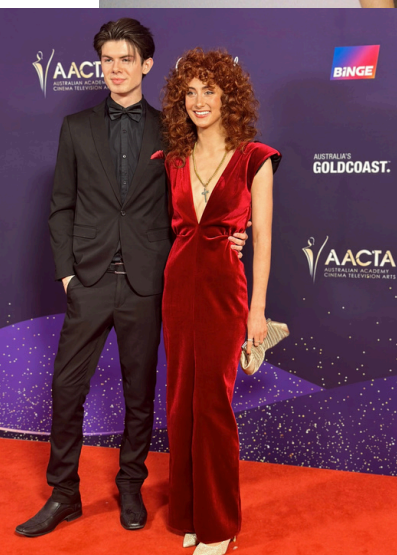
2024 AACTA Awards