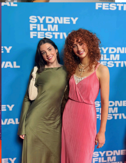
2024 Sydney Film Festival