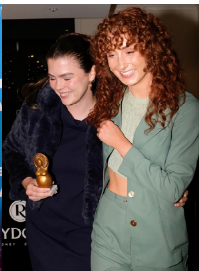
2023 Sydney Women's International Film Fest