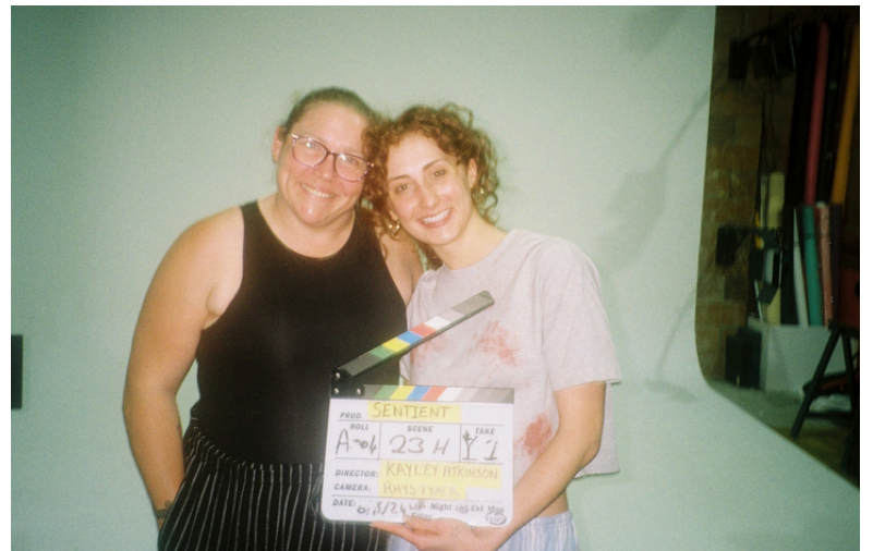
'Sentient' Post Prod - Lead Role 2024