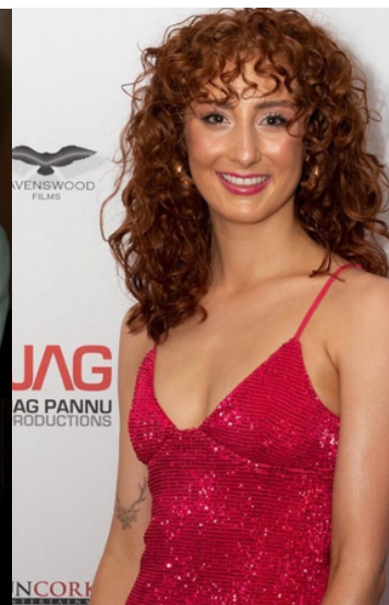
US Premier of "Haunting at Saint Joseph's" 2023