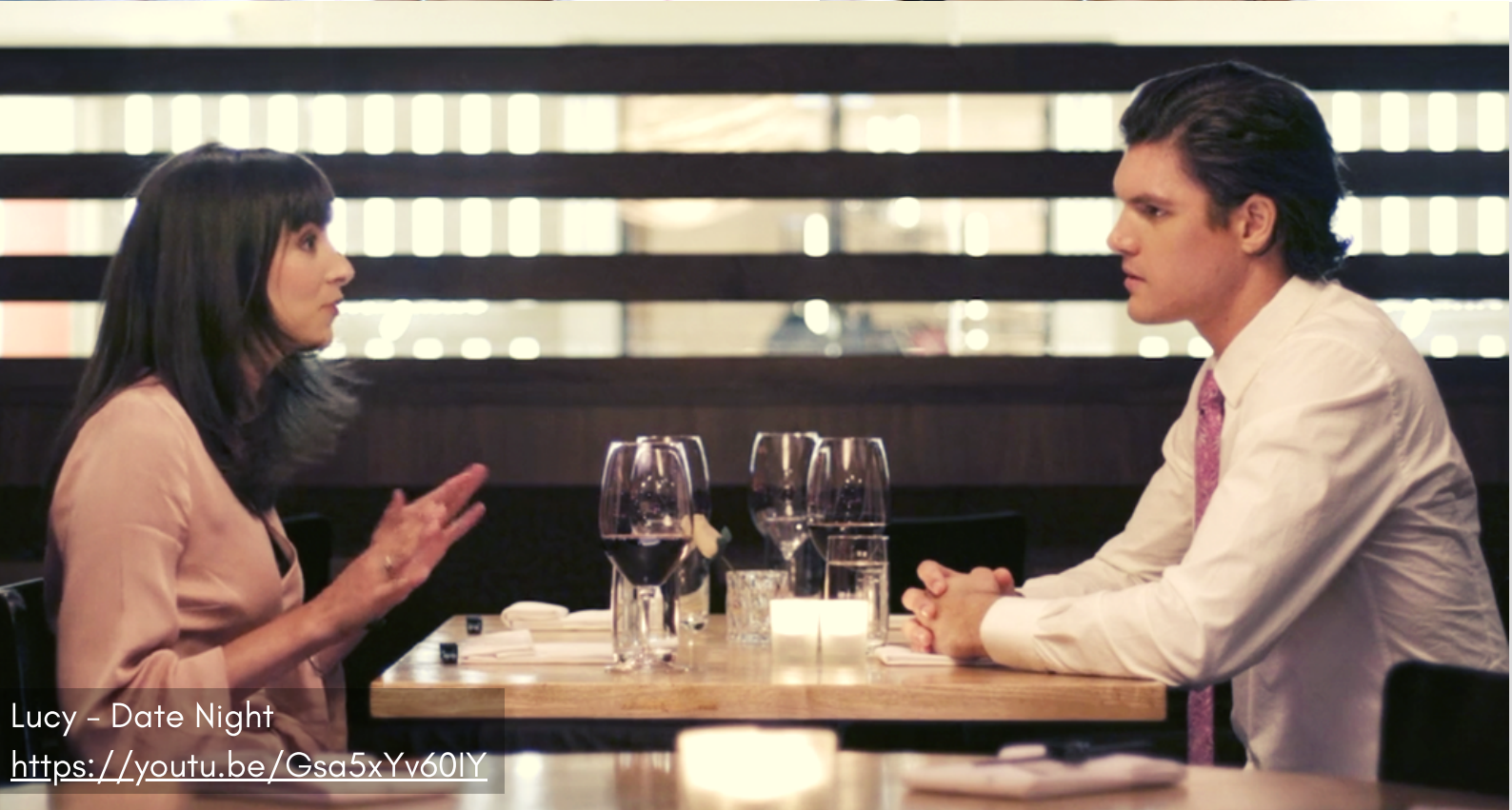
Lucy - Date Night https://youtu.be/Gsa5xYv60IY