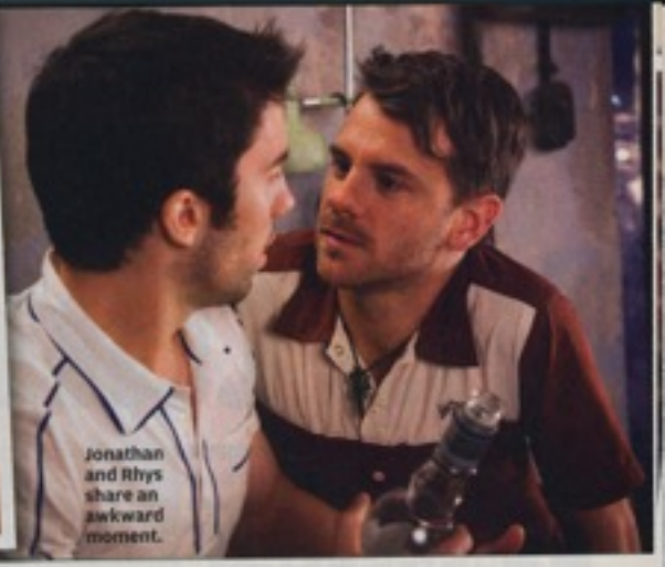
Jonathan and Rhys share an awkward moment.