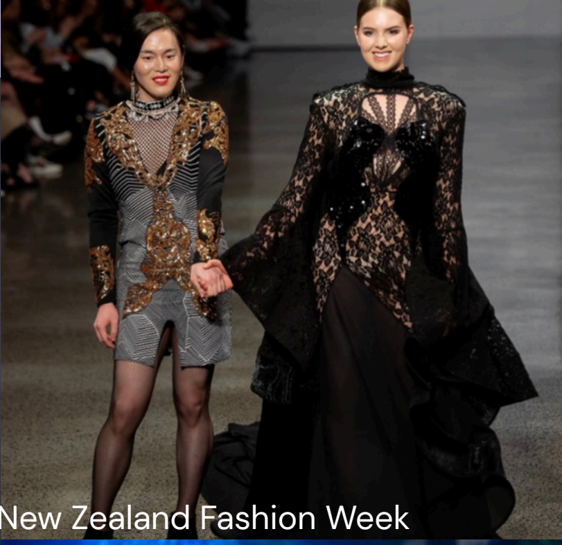
New Zealand Fashion Week