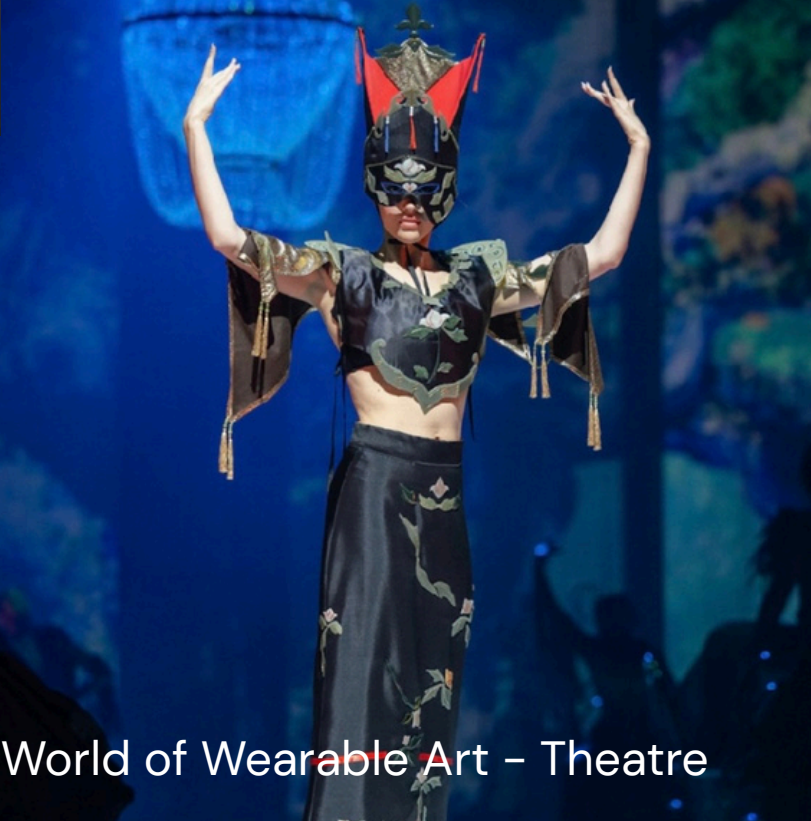
World of Wearable Art - Theatre