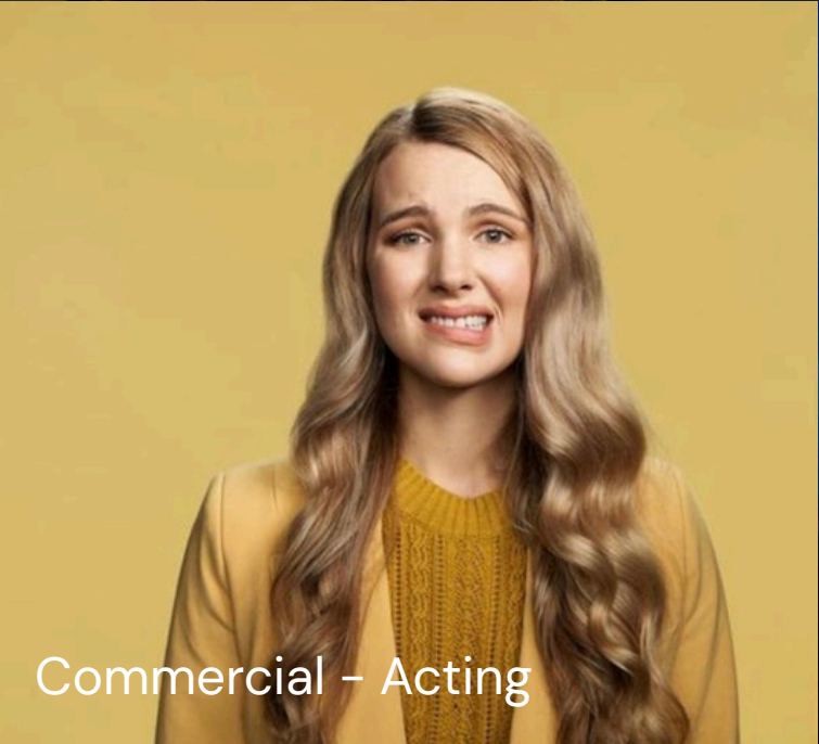
Commercial - Acting