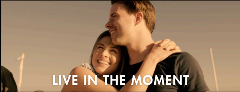
LIVE IN THE MOMENT